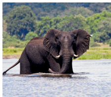
Chobe Day Trip