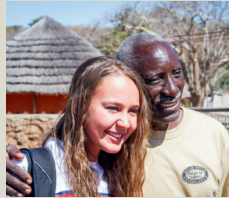
Meet the People Village Tour