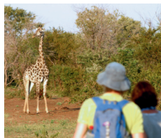
Game Drives & Walks