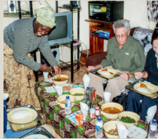
Home Hosted Meals