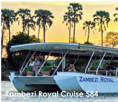
Zambezi Royal Cruise $84