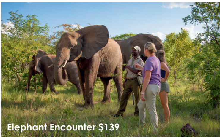
Elephant Encounter $139