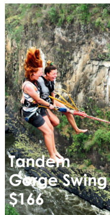
Tandem Gorge Swing $166